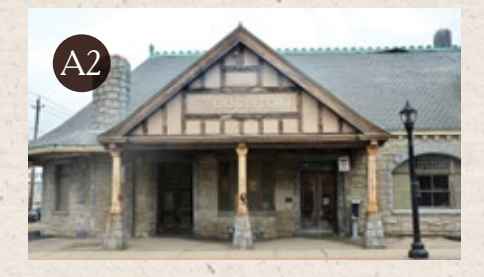
STOUGHTON TRAIN STATION Concord Train Station 45 Wyman Street, Stoughton, MA 02072

A colonial farmstead-turned-country-estate designed by architect and landscape designer, Charles Platt in 1902, this well-designed home and landscape features a mix of formal gardens, fields, and woodlands with 3 miles of trails.