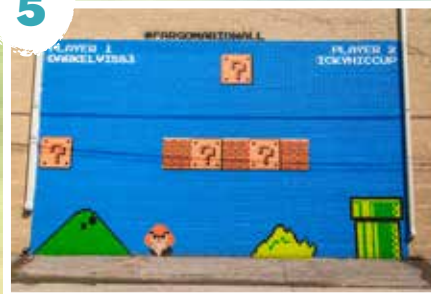
Artists: Dark Elvis & Icky Hiccup