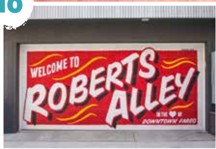
Artist: Tristan Pollock